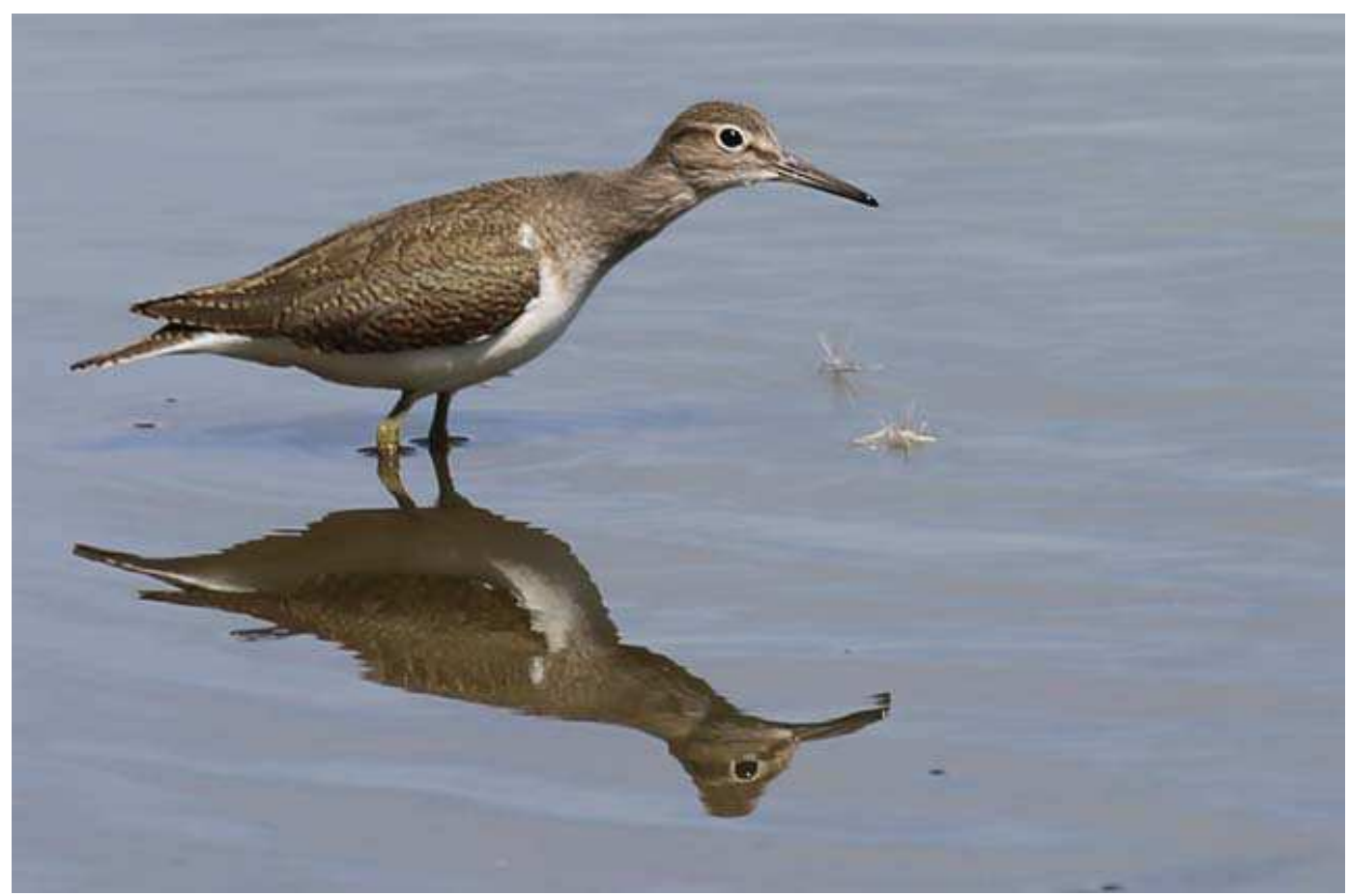
A common Sandpiper at Holywell Pond by Trevor Basey on 1st August

Hobby Several sightings during month. Black Redstart Single at Cocklawburn on 15th.