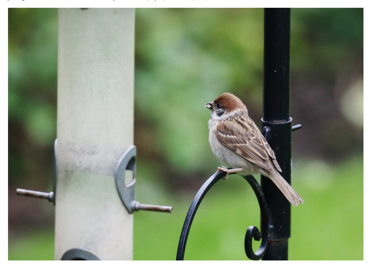
A regular visitor to a Woolsington garden A Tree Sparrow by John Littleton on 25th August

Counts of 16 to 65 were noted at Cresswell Pond on 12th, where ten were present on 6th (DM/PA/AJR/TRD). 45 were seen at East Holywell all month (MNC). 40 were on feeders at Chugdon Wood on 2nd (TB). A flock of 26 fed in stubble at St. Mary's on 25th, where eight flew S. on 23rd (ASJ). 20 were at Haughton Mains on 19th (SW). 13 was the peak at Tynemouth on 22nd where birds were present all month (DRW). Two to four were at five other sites, including a pair feeding young in a nest in a church wall cavity at Horton (Blyth) on 15th (LJM).