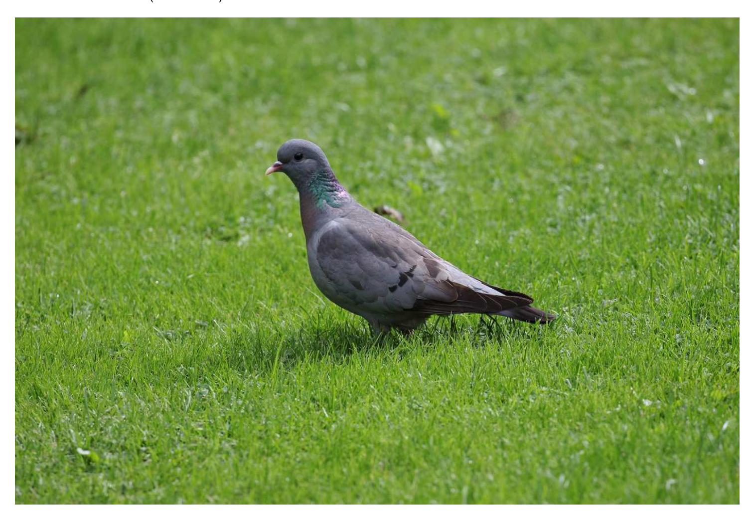
A Stock Dove in a Woolsington garden John Littleton 25th August

Well reported in low numbers with six+ at Whittle Dene Reservoirs on 15th (PRM), five at Jesmond Dene on 5th and Cresswell Pond on 6th (MJCo/TRD) with one to two at nine other locations.