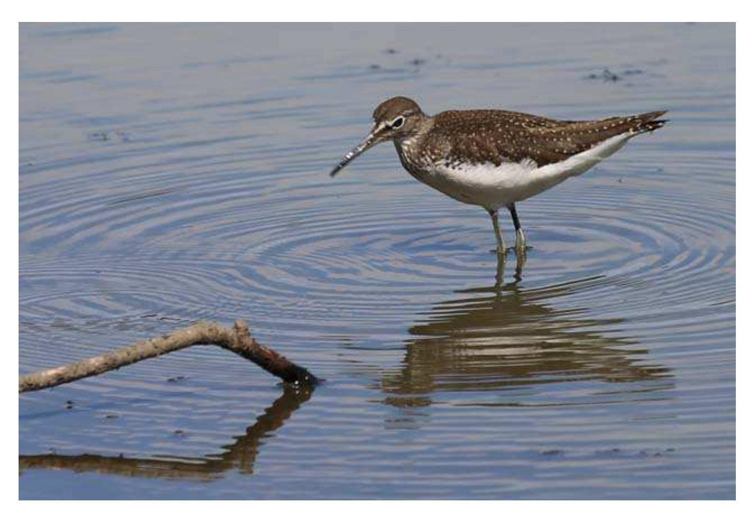
A Green Sandpiper Holywell Pond Trevor Basey August 1st

Three on 1st increased to 12 by 7th at Castle Island (TF/JFa/GB/DM/AC). Further inland, five-six were at Grindon Lough from 21st-23rd reducing to one by 18th (DRW/PRM). Arcot Pond held three on 4th reducing to one by 25th as birds moved through (LJM/GB/DM). Similarly, four were at Budle Bay on 2nd declining to one by 25th (CGK/GPK/RA). One-two were seen mainly during the first half of the month at Backworth Pond, Big Waters, Bothal Pond, Branton GP, Derwent Reservoir, East Chevington, Holy Island, Holywell Pond, Longhirst Flash, Mootlaw Quarry, Newbiggin (Beacon Point and golf course), Ogle Bridge, St Mary's Wetland, Whittle Dene Reservoirs and Woodhorn Flashes.