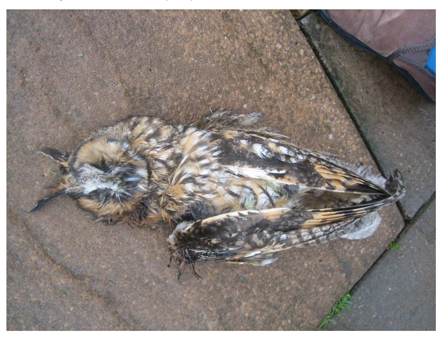
A sad sight. A Long-eared Owl road casualty. Byegate crossroads on 11th August Tony Metcalf

One was at Holy Island on 5th, 12th and 13th (TB/AH).