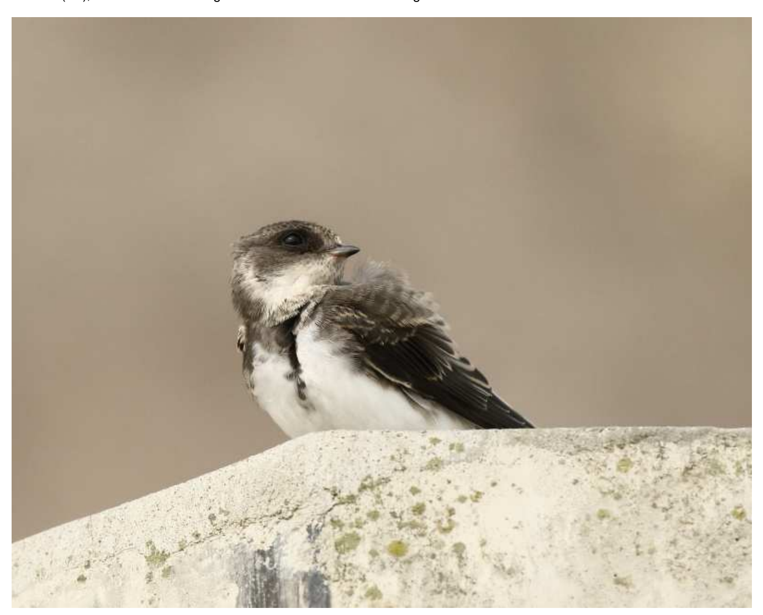
A juvenile Sand Martin St. Mary's 28th August

More than 40 at West Stobswood Pool on 23rd (MSH), 20 at Wark (N.Tyne) on 18th (PRM), 18 at Chugdon Wood (Ellington) on 28th (TB), 15 S at East Chevington NR on 28th and 10 S at Ellington on 2nd. One to six were at five further locations.