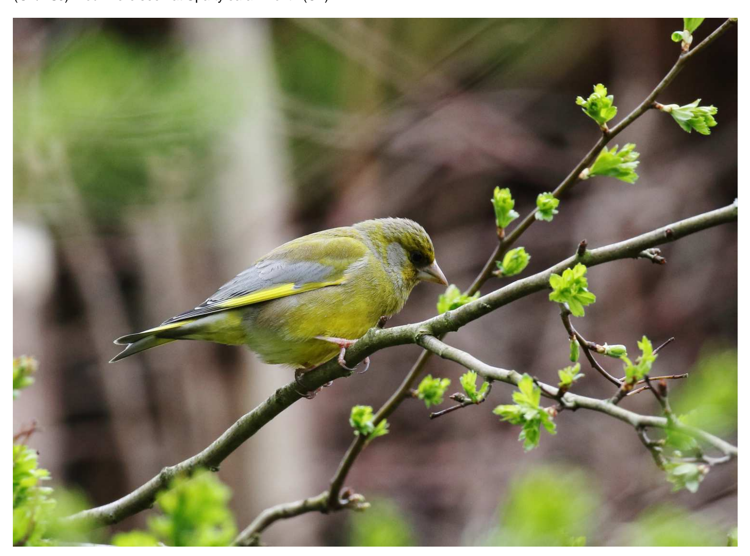
A species becoming less common in recent years A male Greenfinch in Woolsington John Littleton on 25th August

Only four records this month, with 14, including juveniles, feeding on Rose Hips at St. Mary's Wetland on 25th (ASJ). Family parties of five were at Newcastle Exhibition Park on 10th and at feeders in a Marden Estate garden on several dates (GB/ASJ). Four were seen at Spartylea all month (CT).