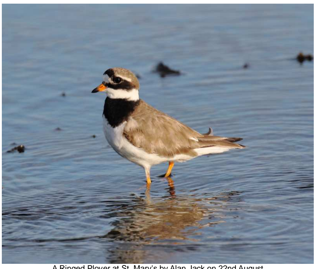
A Ringed Plover at St. Mary's on 22nd August