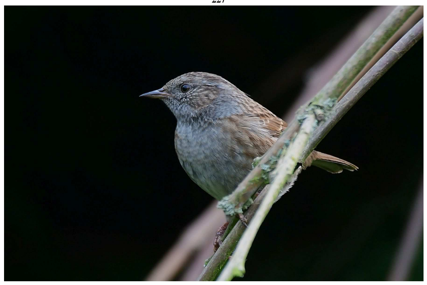
A Dunnock in a Rothbury garden on 28th August